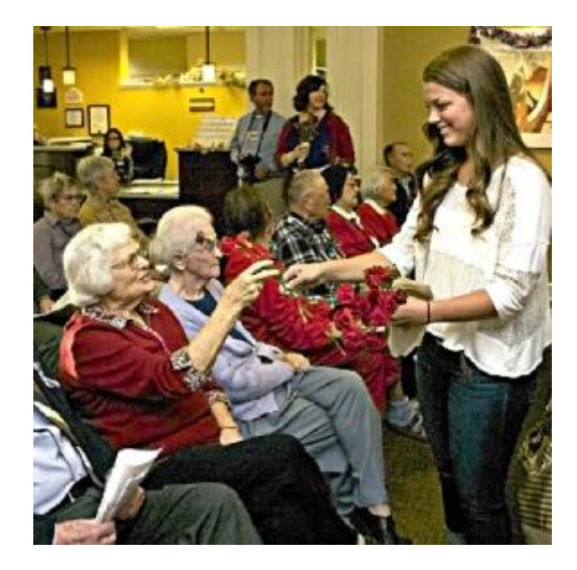
Resident lady veteran's receive carnations from staff members.

Volunteer members of Filmpack Camera Club photographed some of the events at Touchmark