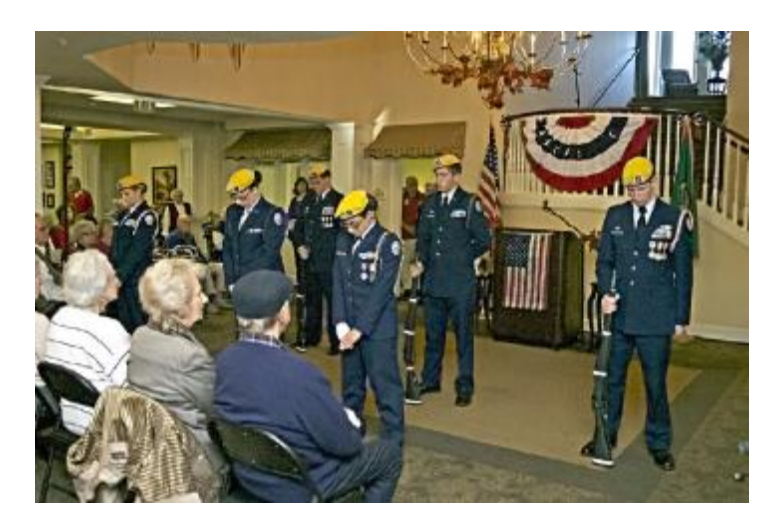
Prairie High School ROTC Drill Team performing.