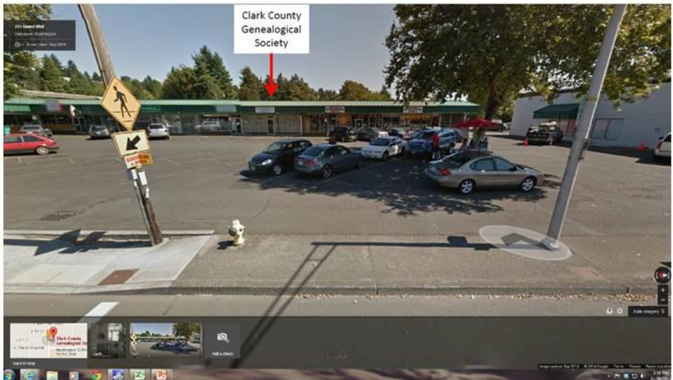
Clark County Genealogical Society 715 Grand Boulevard Vancouver, WA